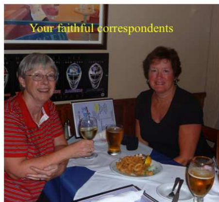
Your faithful correspondents