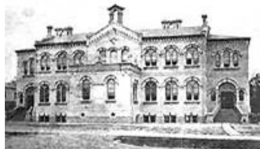
1807 - where it all started - the "root house" 1871 - Toronto High School is renamed Jarvis Street High School in 1873