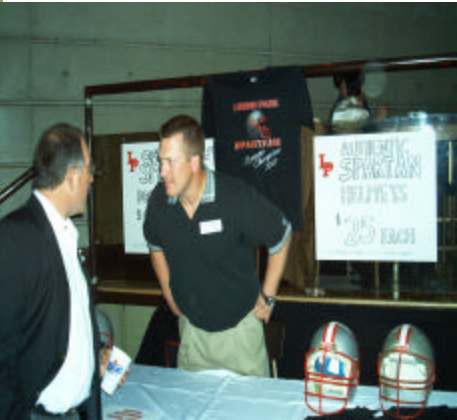
You will buy a helmet—and like it!!!